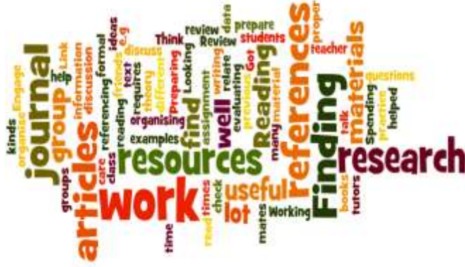
Figure 3. Wordle of Stage 2 Question: As a result of FFI what actions did you take in preparation for your semester 1 assignments?