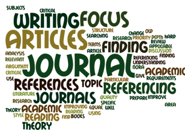
Figure 3. Wordle of responses to Stage 2 question: As a result of FFI what actions did you take in preparation for your semester 1 assignments?

A clearer distinction between feedback analysis and actions taken had been expected. For example, to the latter question some specific actions such as signing up for a class in information literacy, or consulting a specific grammar book were, perhaps naively on the part of the staff, expected. With reference to Gibbs and Simpson’s (2004:25) condition 9 – Feedback is received and attended to – we could conclude here that it had been received but whether it had been attended to, or acted upon could not be established. In other words, we could say that students appear to possess an understanding of the standard, but we