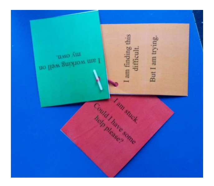
Figure 3. Traffic light assessment tool.

Furthermore, children were beginning to show increased signs of resilience . This was revealed through children articulating their experiences with regards to overcoming barriers within the process of learning. This suggests that they monitored their learning . They then responded to their analysis by backtracking to a point where they, 'felt like they were on the right tracks.' I started to show consistency with probing and responding to the children in light of the learning process. This may indicate that, through reflection, I have built upon the children's responses and the positivity of certain behaviours and attitudes. An example of this was when I emphasised the positivity of Megan's behaviour, through sharing her strategy with the class. Megan, without prompting acted out behaviour which arguably was influenced by the ETF and therefore my influence. This may show a realisation in Megan that she can rely on what she knows to help her. She may be showing initial signs of resourcefulness . I began to find it useful to explicitly share with the children my expectations and the behaviour I expected.